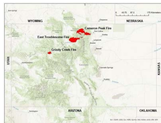
Fig. 1. Subject wildfire locations in Colorado, USA.

Interstate-70 were linked to watersheds.